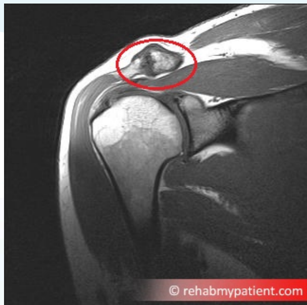
An MRI scan showing osteoarthritis of the AC Joint

On the above MRI scan you can see how the AC joint looks enlarged, thickened, and rough. You will also see the underlying muscle (at the bottom of the red circle) which is the supraspinatus muscle and tendon, deviating away from the ACJ due to shoulder impingement.